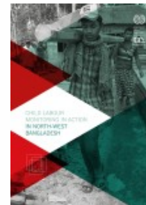
Child labour monitoring in action in North-West Bangladesh