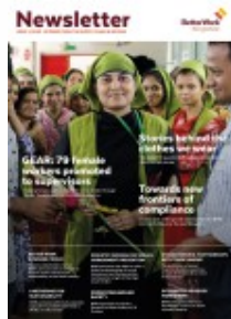
Better Work Bangladesh Newsletter December 2019