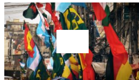
Football fever hits Dhaka

In the fall of 2017, the Permanent Court of Arbitration in The Hague ruled that two international clothing brands which signed the Accord were required to pay over 2 million USD to correct hazardous conditions in more than 200 supplier factories. The two unnamed brands had continued to source from suppliers that refused to correct Accord-identified hazards, prompting the arbitration claim by the international union signatories of the