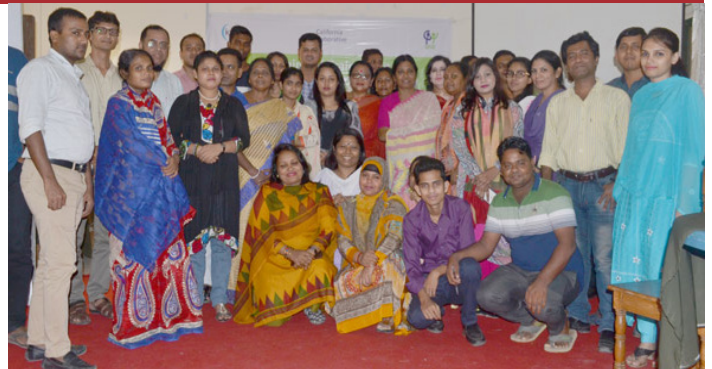
Participants in the Bangladesh OHS Initiative’s first “Train the Trainer” course.

The OHS Initiative launched its “training of trainers” program with a five-day course on effective training techniques and basic occupational health and safety concepts in September. Twenty-nine participants – 15 women – from five organizations attended classes held at the training center of the public health organization Gonoshasthya Kendra in Savar, just outside Dhaka.